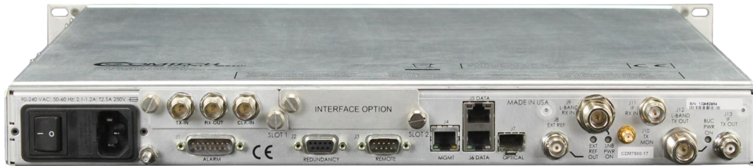
CDM-760 Back Panel