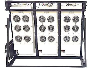
1:2 Redundant Version